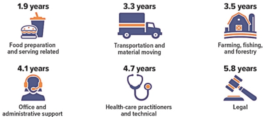
Employee tenure, by occupation